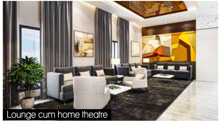
Lounge cum home theatre