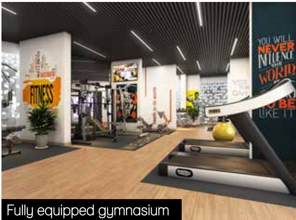
Fully equipped gymnasium