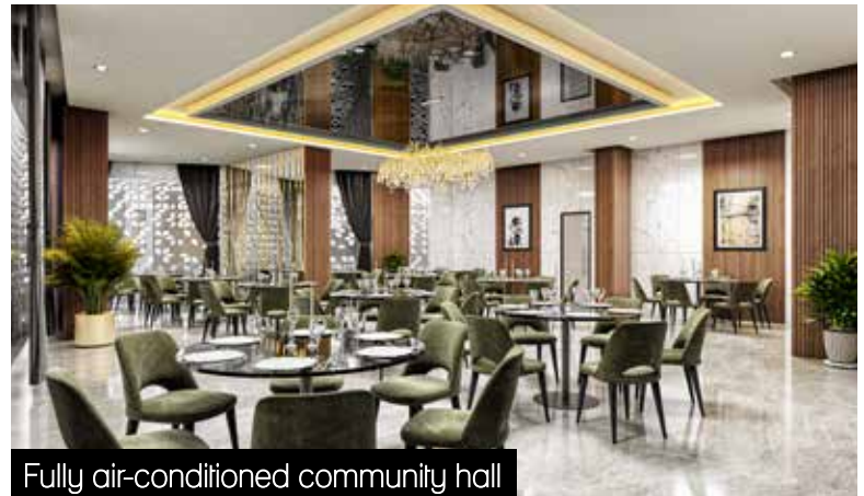
Fully air-conditioned community hall