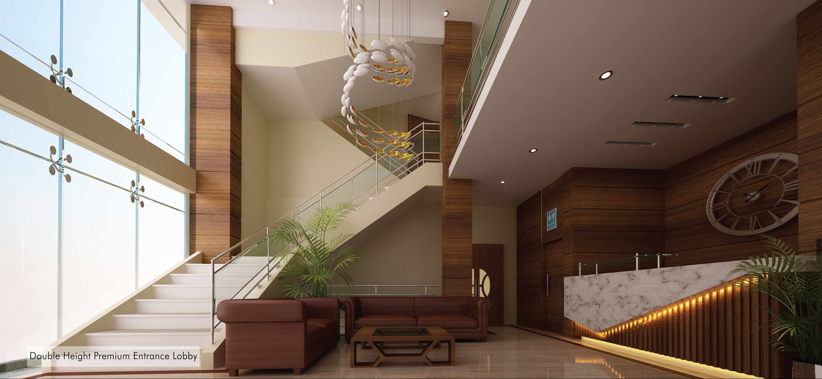
Double Height Premium Entrance Lobby